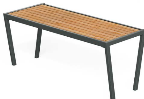
CASTEO TA W